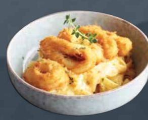
CALAMARI SALTED EGG YOLK rm 22 (chili)