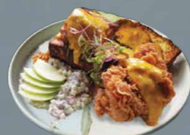
BUTTERMILK FRENCH TOAST w FRIED CHICKEN rm 23