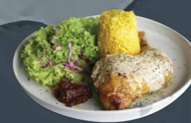
TURMERIC BUTTER CHICKEN rm 23