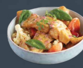
LEMON BUTTER FISH rm 28