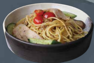
AGLIO OLIO rm 14 (chili)