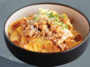
HOT BUNNY CRAB rm 25