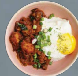
KEN'S CURRY rm 16 (chili)