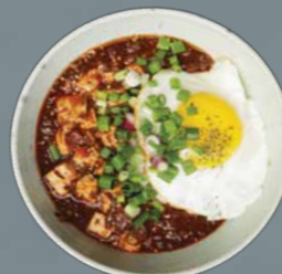
SZE CHUAN MAPO TOFU rm 19 (chili)