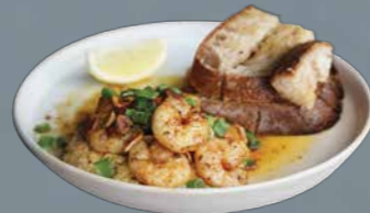
GARLIC BUTTER WHITELEG PRAWN rm 36