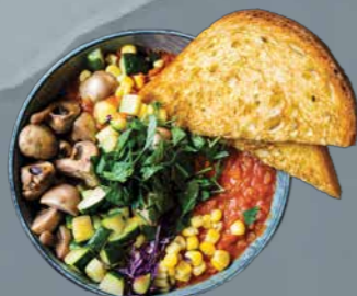
CAJUN LENTIL STEW rm 18 (vegetarian)