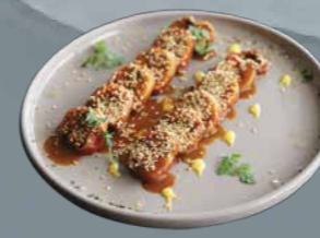
CHICKEN ROULADE rm 19