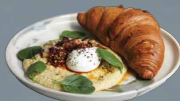
DRIED SHRIMP EGGPLANT HUMMUS rm 19