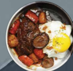
AYAM PONGTEH rm 18