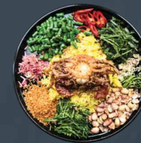
NASI ULAM SOFT SHELL CRAB rm 28