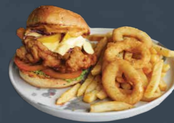
MALA WHOLE LEG CHICKEN BURGER rm 24