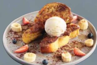
FRENCH TOAST rm 23