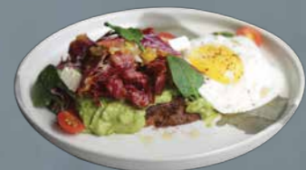
AVOCADO TOAST rm 23 (beef)