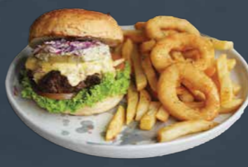
REAL CHEESE BURGER w 130g AUSSIE BEEF rm 28 (beef)