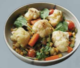
GARLIC BUTTER CAULIFLOWER rm 15