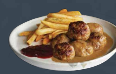
HANDMADE MEATBALLS (200g) w CREAM SAUCE rm 19 (beef)