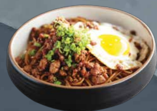
SAHCHA rm 19