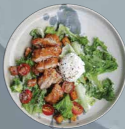
CAESAR SALAD w HAND-BATTERED FRIED CHICKEN rm 22