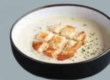
DOUBLE BOILED MUSHROOM SOUP rm 9