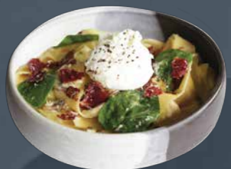
TRUFFLE CARBONARA w BACON BRISKET rm 26 (beef)