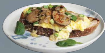
WILD MUSHROOM SCRAMBLE EGG TOAST rm 19