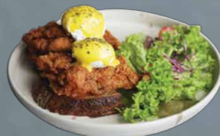
EGGS BENEDICT /rm 26 EGGS WALDORE /rm 21