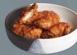
HAND-BATTERED FRIED CHICKEN ORIGINAL/MALA 麻辣 rm 19