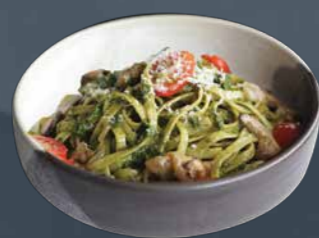
FETTUCINE PESTO rm 19