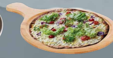
SOUR CREAM CHEESE PIZZA rm 33