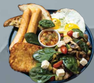
BIG BREAKFAST rm 28