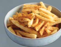
THICK CUT FRIES rm 12 (vegetarian) (chili)