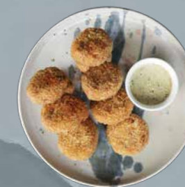
MEXICAN FISH CAKE (7pcs) rm 18